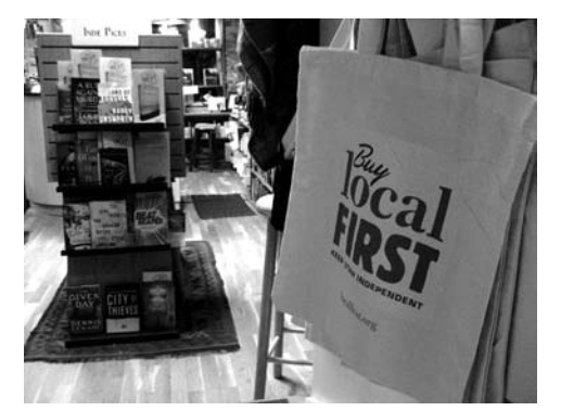
The King's English Bookshop in Salt Lake City attracts steady business from community-minded shoppers, despite big-box and online competition. It was one of the founding members of a statewide buy-local campaign that now includes 2,000 participating merchants.

paign, which has been voted "best local cause" in an annual newspaper readers poll for three years running, is helping them weather the recession. Although Portland residents have cut back on spending, many seem to be making a