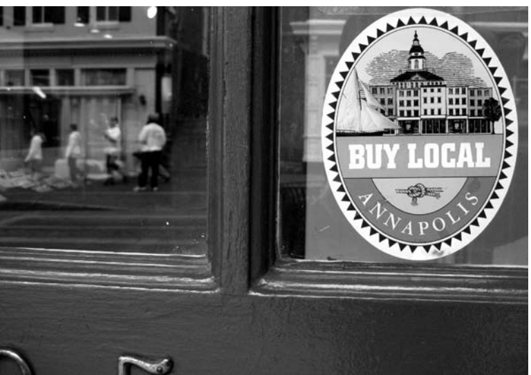
Window decals, counter displays, posters, and banners are low-cost and highly effective tools for publicizing the "buy local" message to large numbers of area residents.