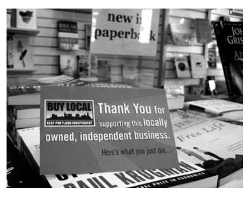
Buy-local campaigns work by educating consumers about the wider community benefits of supporting local merchants. This "Thank You" note in the window of Longfellow Books in Portland, Maine, emphasizes that message.

spent at locally owned businesses generates significantly more local economic activity and supports more local jobs than $100 spent at national chains. (This is because independent retailers purchase more goods and services from other local businesses than chains do.)