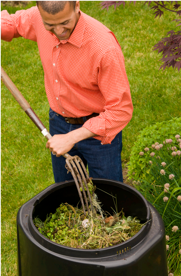
▲ Mixing an Oregon Metro provided FreeGarden™ Earth compost bin.