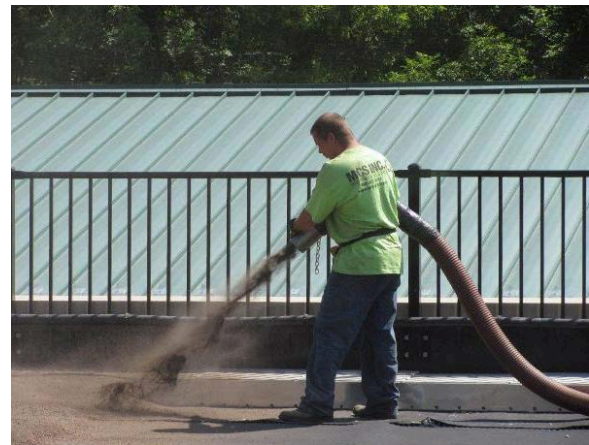
MCS Inc. worker installing growing media made from compost on green roof. www.mcsnjinc.com

30 to 35 FTE employees, four of whom work on compost projects. 19