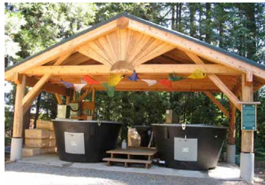
In-vessel Earth Tub compost system installed at the Breitenbush retreat center in Oregon.