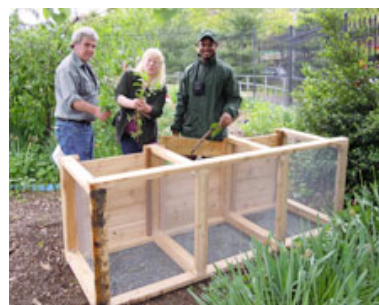
Three-bin composting unit used in the New York City Compost Project for community-based gardens.