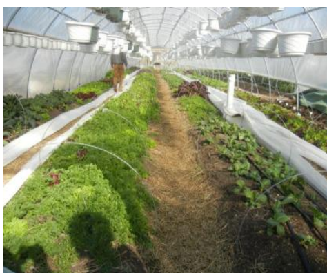
ECO City Farms in Edmonston, Maryland, uses several stages and techniques of composting, including vermicomposting, to produce a soil for use in its produce hoop houses.

Composting and vermiculture (worm composting) form the foundation of its farm. ECO City diverts organic matter from the waste stream, and combines different composting techniques to turn it into fertile soil that supports the production of farm products. The farm accepts compostable material dropped off at its urban farm and at a local weekly farmers market (Riverdale Park Farmers Market). It also accepts residential kitchen scraps delivered by Compost Cab, a private niche collection service provider operating in the Washington, DC metropolitan region.