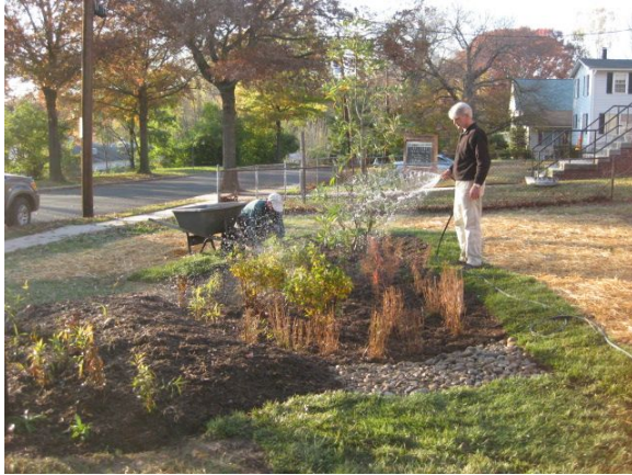
The Montgomery County, MD RainScapes Rewards Rebate program requires 3 inches of compost for its conservation landscape projects, incorporated to create a 6-12 inch improved soil layer.

local agriculture in a closed-loop system, while supporting many more jobs in various industries including horticulture and turf projects. 23 Envirotech is just one company that has previously used Blessings Blends for its projects, which demonstrates how recovered organics can support business and extend the life span of resources, rather than reaching a final resting place at a landfill or incinerator. 24