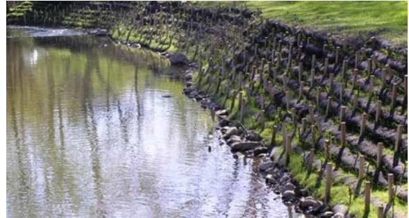
MCS Inc. streambed restoration project using compost. www.mcsnjinc.com