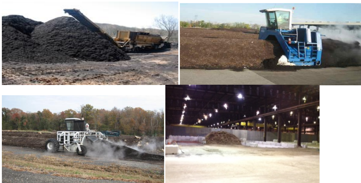
Clockwise from top left: 1. Finished compost at Recycled Green Industries in Woodbine. 2. Windrow turner at Montgomery's County's yard trim composting site in Dickerson. 3. Chesapeake Compost Works new food scrap composting site in Baltimore. 4. City of College Park's yard trim windrow turner at work.

In the 2013 legislative session, The MD Assembly passed HB 1440: Recycling-Composting Facilities (introduced by Del. Heather Mizeur), a bill that will advance composting by allowing the MD Department of the Environment (MDE) to establish a permit system for composting facilities and exclude source-separated materials from being regulated as a solid waste. The bill paves the way for MDE to address the regulatory hurdles facing MD composters and create a clear regulatory pathway for composting facilities.