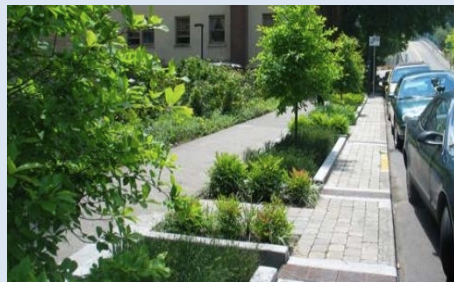
Portland, OR, street planters, curb extensions, and simple green strips in the medians along city streets: