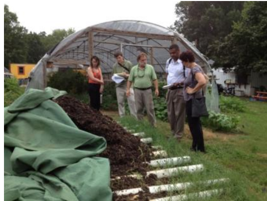
Low-tech aerated static pile composting system at Eco City Farms, Edmonston, Maryland.

Vermicomposting or worm composting is another type of process that decomposes organic materials into a rich humus or soil amendment using special species of worm. Eisenia fetida , commonly called red wigglers, are the most popular.