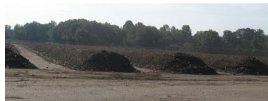
Windrow composting at the Prince George's County Western Branch yard trimmings compost site, Upper Marlboro.