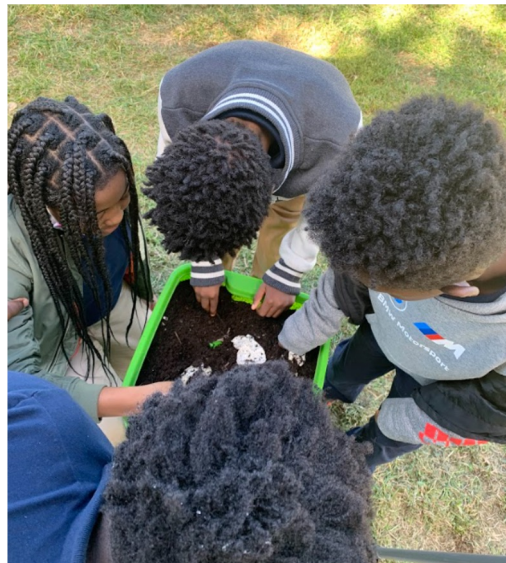
Farm to School