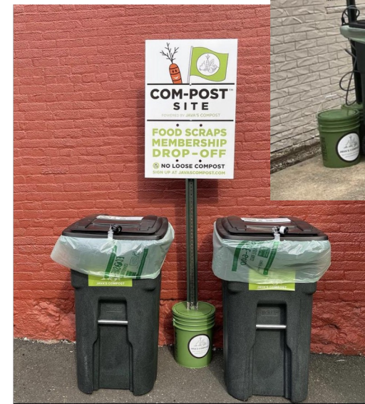
Sustainable Hause- refill shop