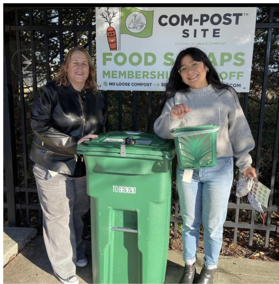
Greater Newark Conservancy