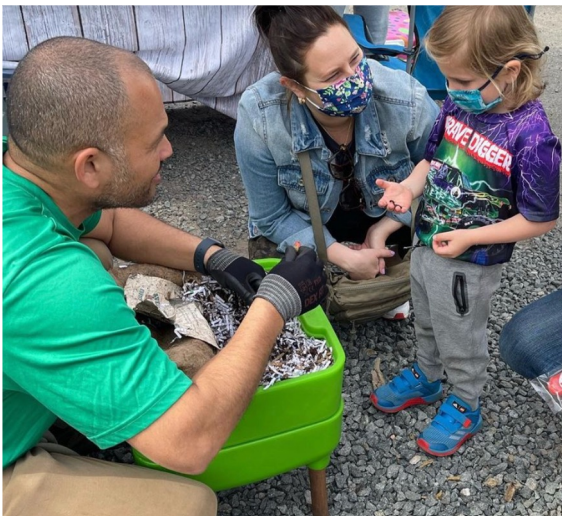
Compost Give Back