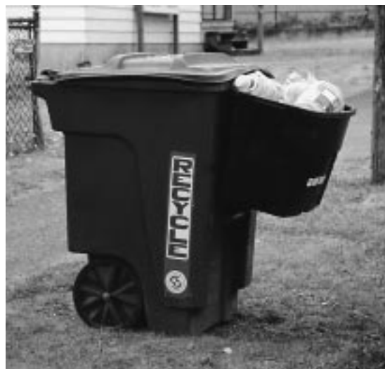
Curbside recycling set-out in south section of city. Residents receive monthly collection service.