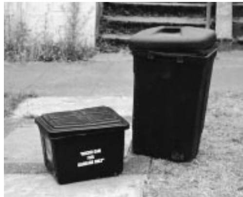
Micro-can and 32-gallon trash can sizes used in Seattle's pay-as-you-throw trash program.

The Seattle Public Utilities' Green Neighborhoods program sponsors "Less is More" grants, which fund innovative waste reduction projects in Seattle.