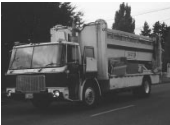
Recycling truck servicing north section of city.