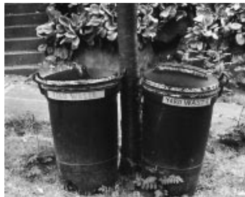
Yard debris containers set out for collection.

Twice a year the Seattle Public Utilities produces and direct mails to all residential