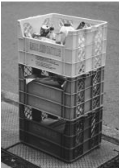
Curbside recycling set-out in north section of city. Residents receive weekly collection of materials.

Recyclable materials collected through the city's residential collection programs are processed at two private facilities: the Rabanco Recycling Center and the Recycle America Processing Center. The Rabanco Recycling Center (capacity 500-700 tons per day) processes recyclables from Recycle Seattle's residential collection program, from General Disposal's and Recycle Seattle II's MFD recycling programs, and from commercial sources. The facility uses conveyors, trommel and disc screens, magnetic separation, air classification, and hand-sorting to separate materials. The Recycle America Processing Center (capacity 350 tons per day) processes material