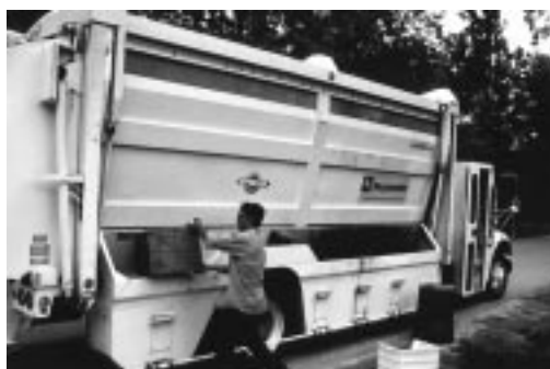
BFI uses a 38-cubic-yard split side-loading truck to collect recyclables.

Residents can deliver non-woody yard debris to a drop-off center located at Fitchburg City Hall. City staff remove contaminants and land spread it. 4