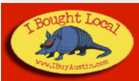
Austin Independent Business Alliance sticker Austin, Texas