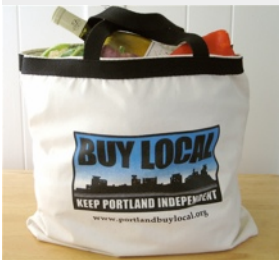
Portland Buy Local tote bag Portland, Maine