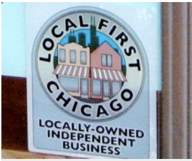
Local First Chicago storefront decal Chicago, Illinois