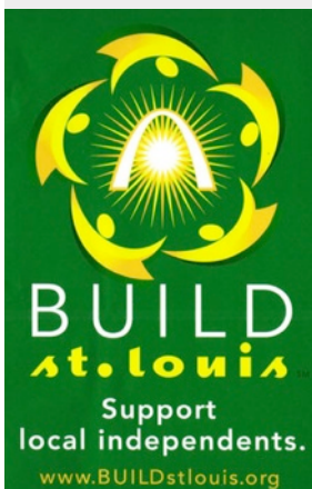
BUILD St. Louis storefront decal St. Louis, MO