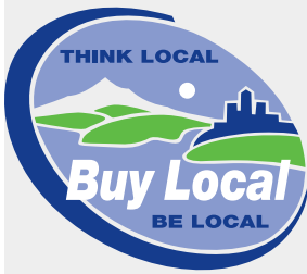
Think Local Portland window decal Portland, Oregon