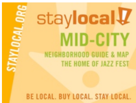
StayLocal! neighborhood business directory New Orleans, LA