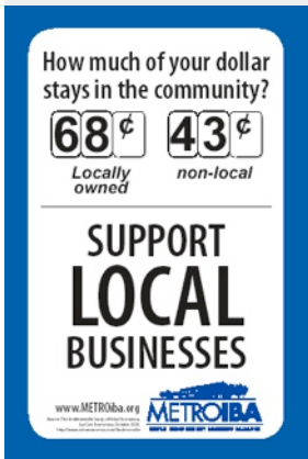
Metro Independent Business Alliance poster Minneapolis-St. Paul, MN

Many people give little consideration to the choice between a locally owned store and a chain when deciding where to shop. They do not know the benefits to their city's economy of choosing local businesses and are unaware of the many hidden costs of opting for the big boxes.