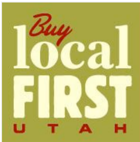
Local First Utah logo statewide