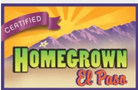
Homegrown El Paso logo El Paso, Texas