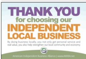
American Independent Business Alliance storefront decal