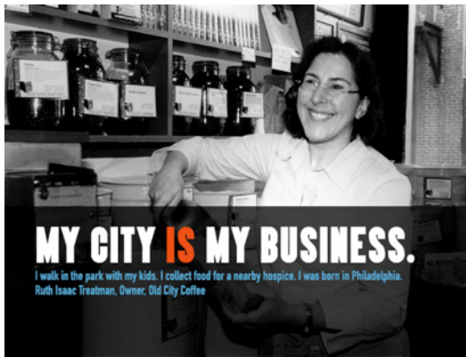
Sustainable Business Network of Philadelphia

see if they have contact information for local business owners, including either an email or postal address.)